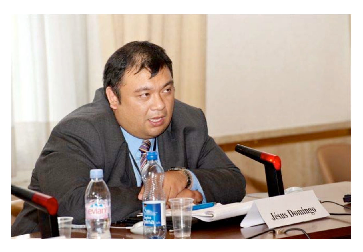
Minister Dr. Jesus Domingo, Permanent Representative of the Philippine Mission of Disarmament and Humanitarian Affairs at the United Nations in Geneva – Switzerland, Co-founder Geneva Interfaith Intercultural Alliance (GIIA)

The concluding remarks of the panel were given by Minister Jesus Domingo , minister of disarmament and humanitarian affairs of the Philippine Mission to the UN in Geneva and co-founder of GIIA. Minister Domingo emphasized the need for civil society's greater involvement in disarmament and other issues that have been hidden in the halls of the UN. The Model UN Interreligious Council and interreligious cooperation for peace building in general will increase security and mutual trust among communities and other stakeholders. He emphasized the need for citizens' creative initiatives, taking responsibility to educate and inform ourselves so as to be able to speak out knowledgeably in at least one sector of broader fields- like small arms for disarmament. In this way, the international ongoing disarmament efforts can be supported and our communities can be kept informed. Min. Domingo also spoke on behalf of the GIIA bureau in calling for a broader alliance of youth through inviting other Model UN associations in the Geneva and Lausanne area to prepare events at the UN together.