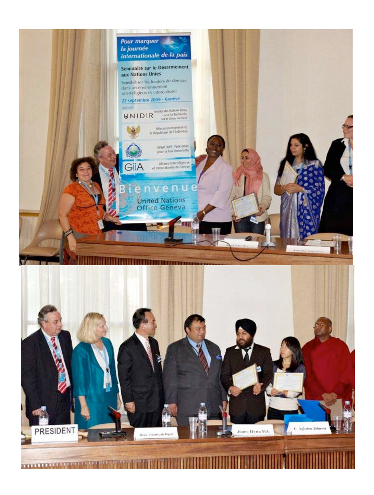
HH/CH United Nations, Geneva - Sept. 23, 2009